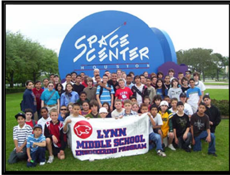
Lynn Middle School Engineering Magnet program students at the Space Center Houston during their trip to Houston and Galveston.